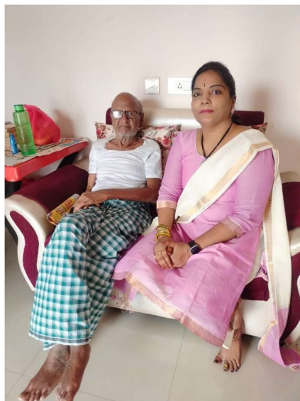
(Visit on 22-10-23)